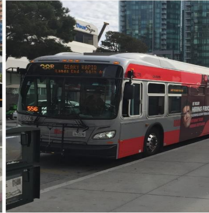
Transit and School Buses