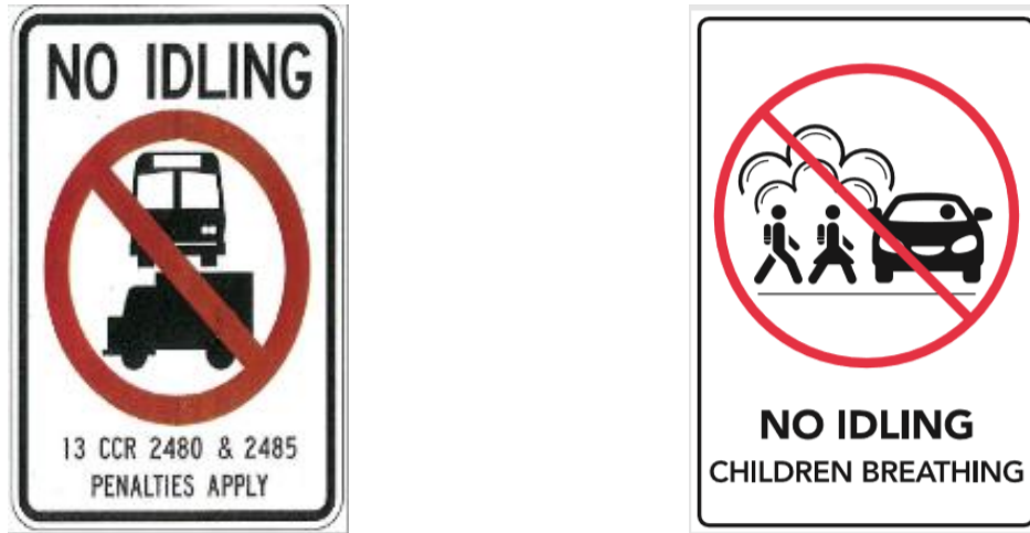
Figure 4. No Idling Signs.

CARB does not have authority over the idling of passenger vehicles but staff understands that compounded emissions during school pick-up and drop-off have been a concern to community members in Shafter and in other AB 617 communities Statewide. CARB is prepared to provide a number of signs to the community, if requested, as well as to speak directly with school administration, teachers, staff, and the greater school community about CARB's "No Idling" signs and our rules.