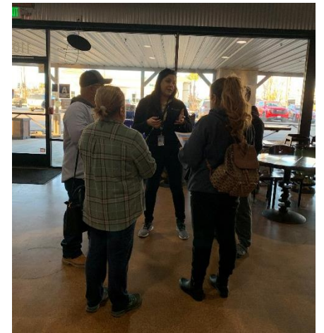
Shafter Fireplace Show-and-Tell Event